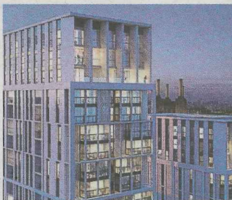
Flagship scheme: Battersea Exchange

Towering influence: The redevelopment of Battersea Power Station will transform the area