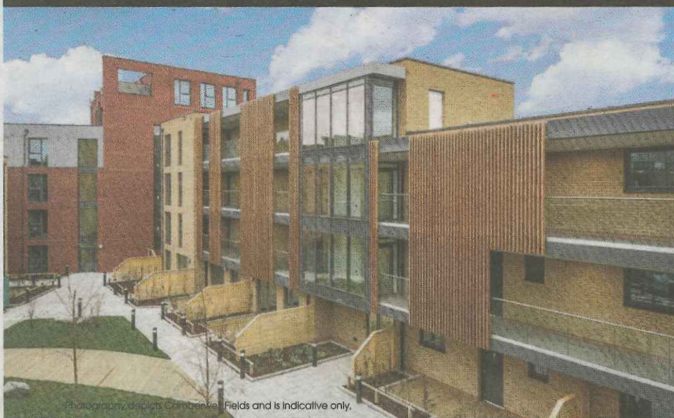
Photography depicts Camberwell Fields and is indicative only.

*Starting price is for wheelchair adaptable apartment, non-wheelchair adaptable apartment starting from £520,000. Terms and conditions apply. Offer applied to selected plots only, subject to status and availability. For further information please call our sales agents on 020 3411 2026.