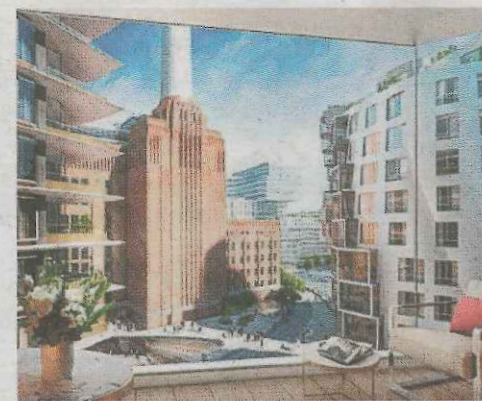
Power of change: Battersea is on the up